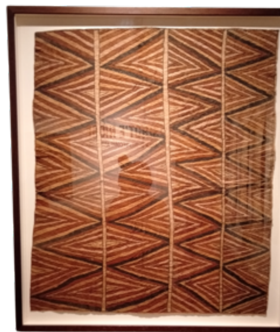
Onestmus Ugibari b 1974 Sidoraje Gora village Hon'e Sopr'e - aerial view of cut bamboo design Nioge 66 x 80 cm Framed $2290