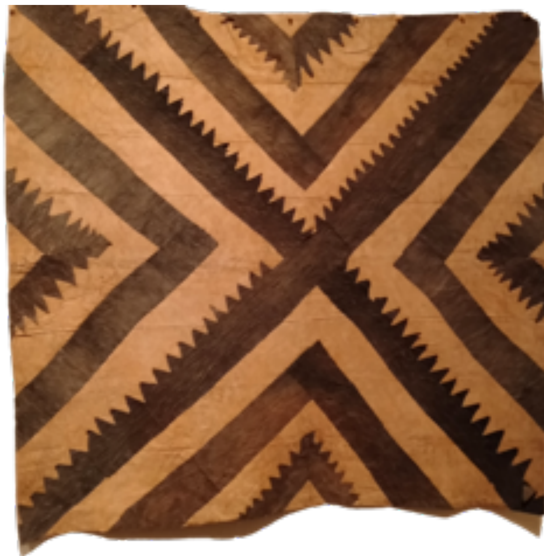
Onestmus Ugibari b 1974 Sidoraje Gora village Mododa'e Diburi'e - tail feathers of the Swift bird 2023 sihot'e 139 x 99 cm $1850