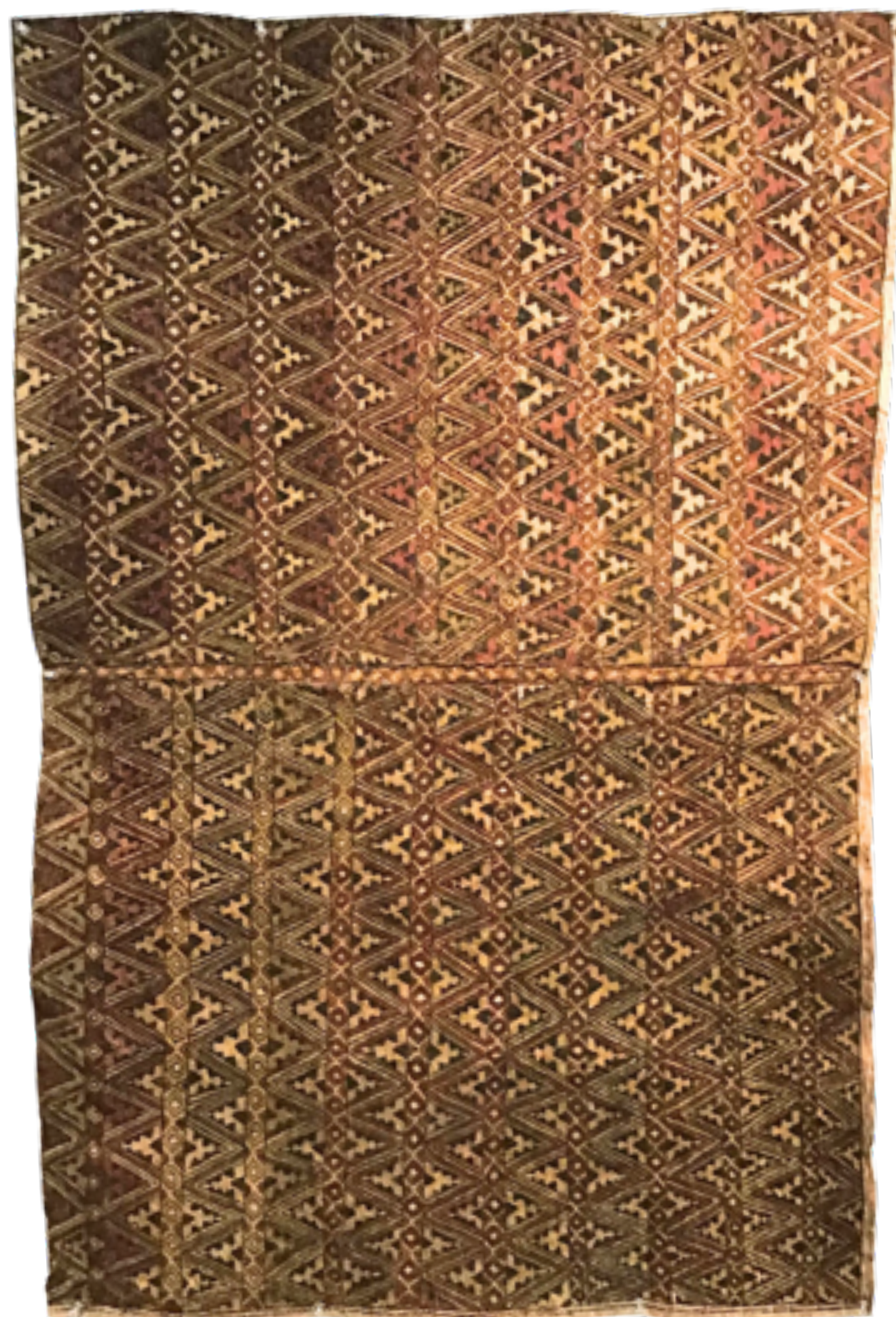
Elizabeth Ruvosemi l'eama b. 1981 Sahoteraje, Asafa Odunaige, vishu ljahe, Dahuro'e, Ore Sige – unfurling ferns, teeth of a fish, mountains, pathways 2019 Nioge 121 x 78 cm $1990