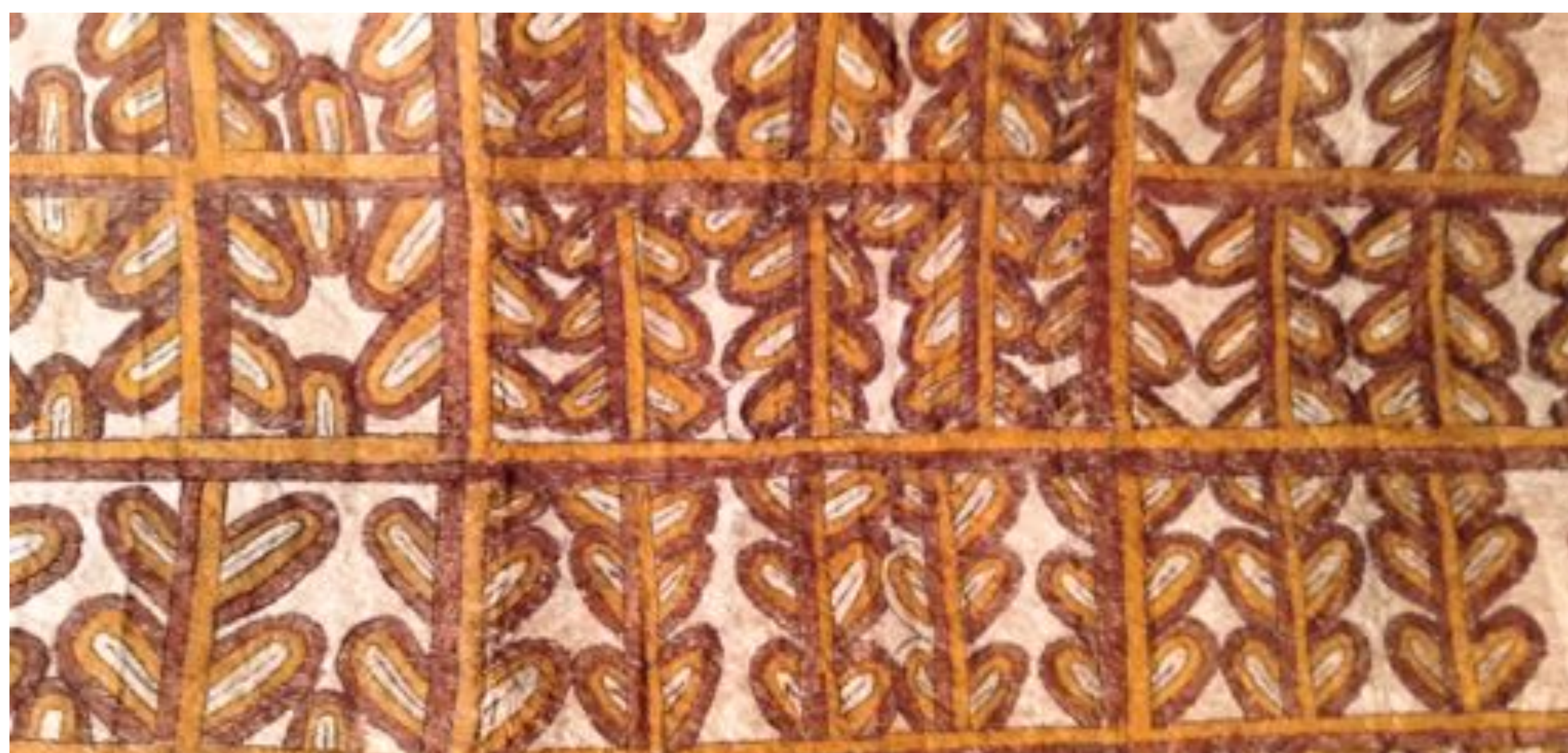
Terry Rorai. b.1992 Sahote beriraje, Gora Village DETAIL: Bubore Dehe - Wing feathers of the hornbill bird used for traditional dancing and ceremony Nioge 132 x 48cm $2190