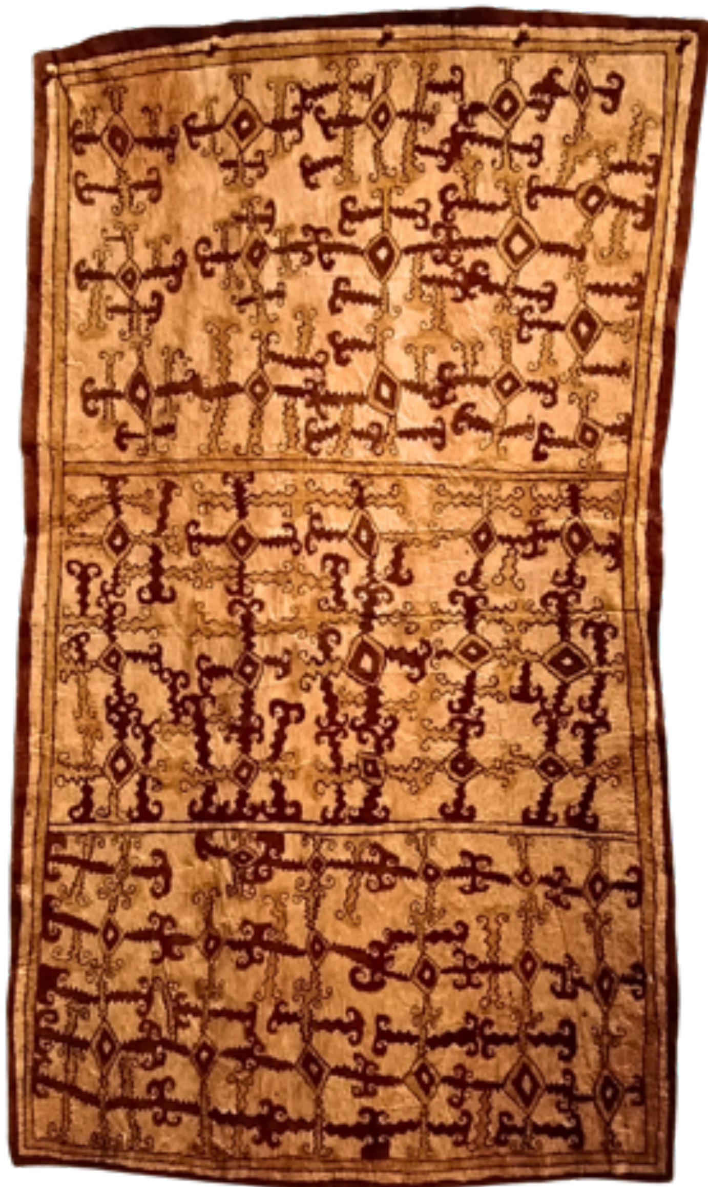
Gratel Ririmi. b. 1972 Nugoraje, Gora village Vinohe Initiant - belly button tattoo design Nioge 101 x 57 cm $1450