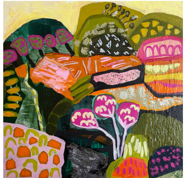
Sydney Harbour 43 x 43 cm Acrylic and Collage on Board $590