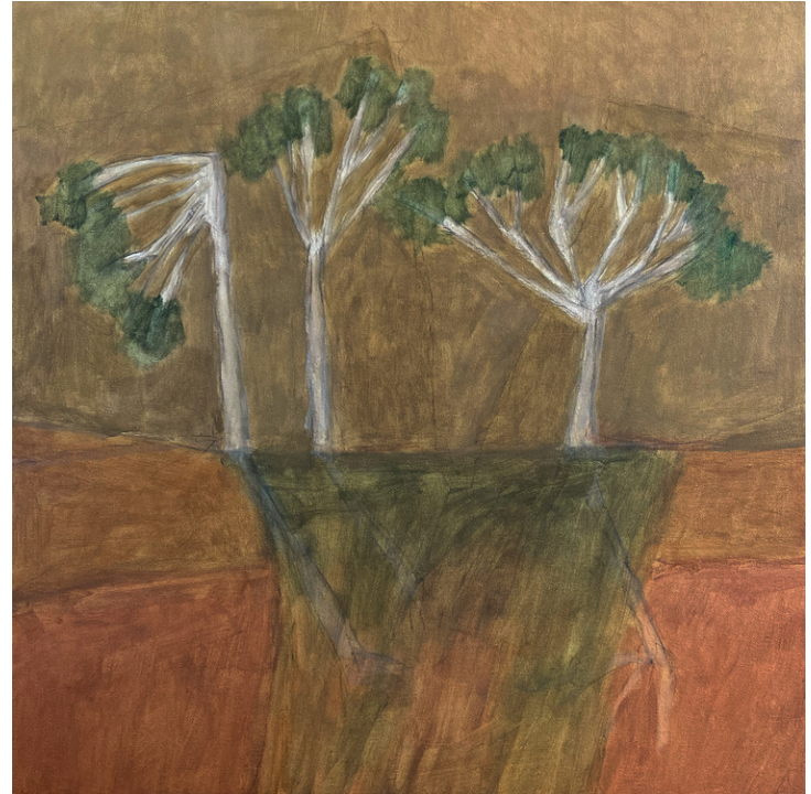
Highland Walz 61 x 61 cm acrylics, oil pastel and charcoal on canvas, framed, $2200