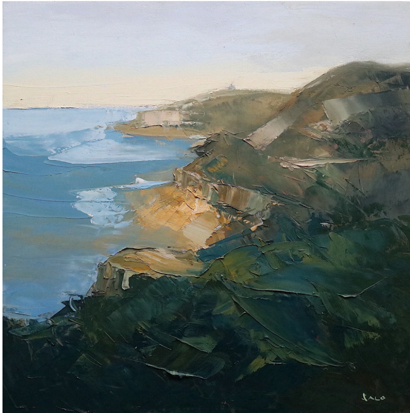
The Back Beach of Sorrento Oil and Beeswax on Belgian linen, 50 x 50cm $2500