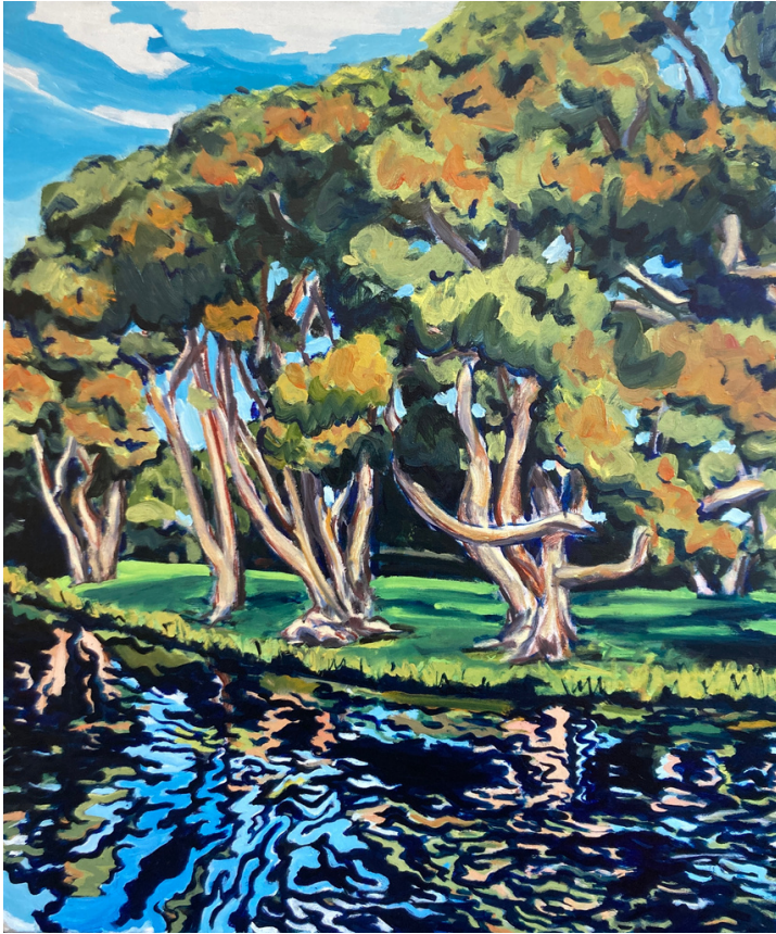
Centennial Parklands 66 x 56 cm, oil on Italian polycotton $750