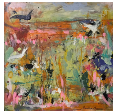
At the green pond