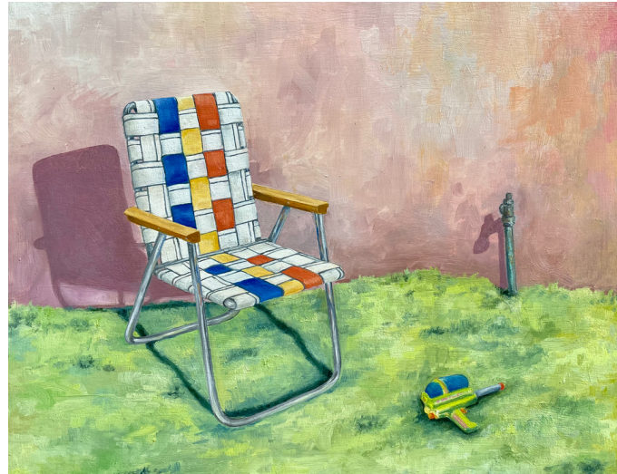
Late Summer Afternoon 20 x 25 cm Oil On Board, framed $600