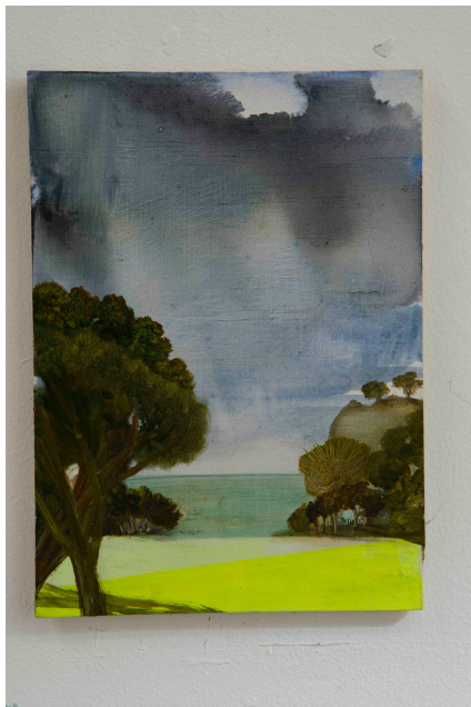
Hideaway retreat to the forgotten lands Acrylic and ink on board 22.5 x 16.5cm $750