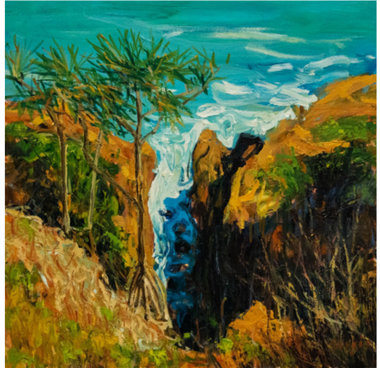
Goolawah National Park 1 oil on canvas, framed 61.5 x 61.5 cm $1350