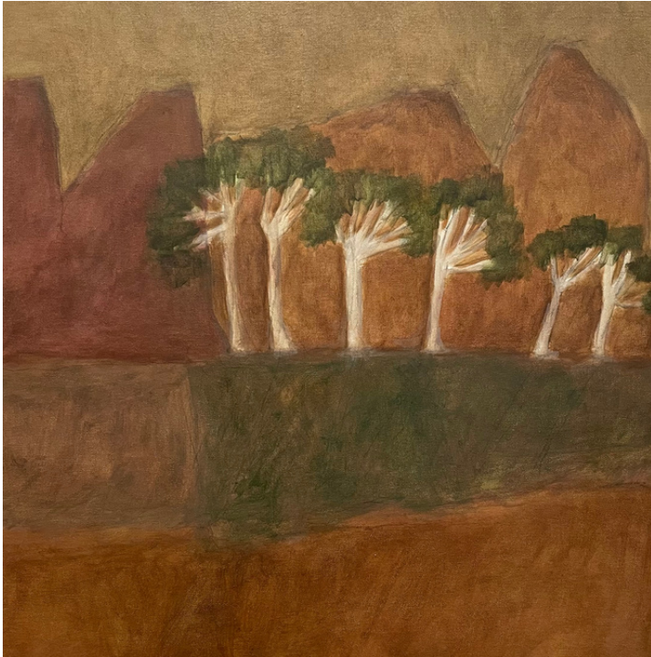
Forget You Not 61 x 61 cm acrylics, oil pastel and charcoal on canvas, framed, $2200