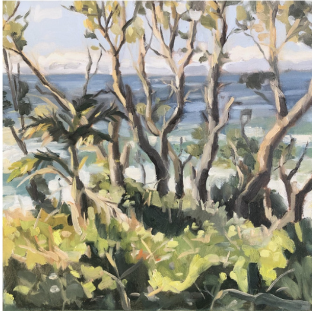
Mid morning light (Wombarra), 46x46cm oil on canvas, framed, $900