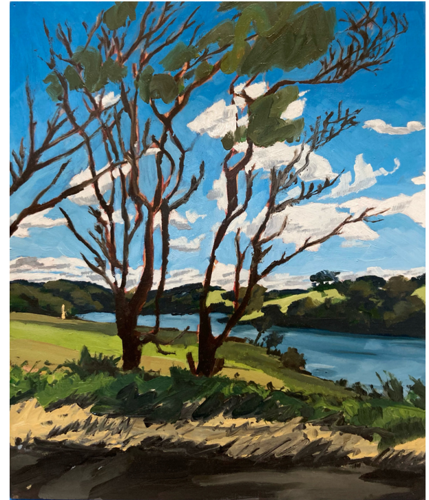
A day of sun in a week of rain 30 x 25cm, oil on birch panel $300