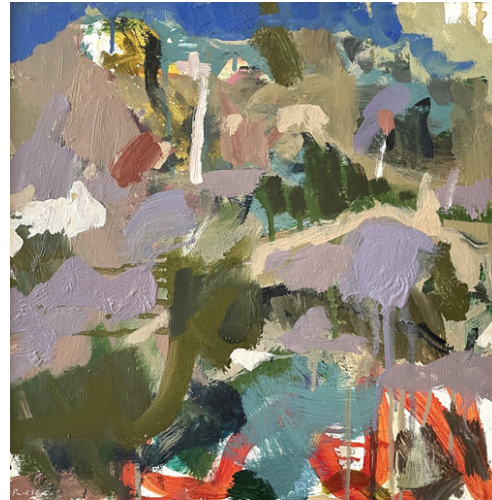
Border Ranges I, 40cm x 40cm, oil on board, framed $840.00