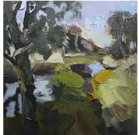
Banks of the Moorabool River Acrylic on Belgian linen 50 x 50cm $2500