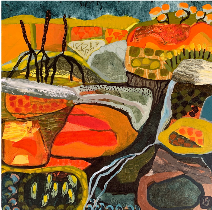
From My Kayak - Sydney Harbour 53 x 53 cm Acrylic and Collage on Board $850