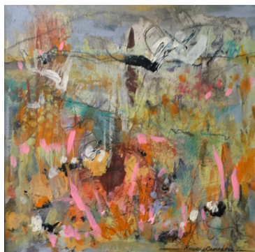
Flight over Wetlands,

Acrylic, mixed media on birch panels, 34 x34 cm (Framed in white box frames). each $395