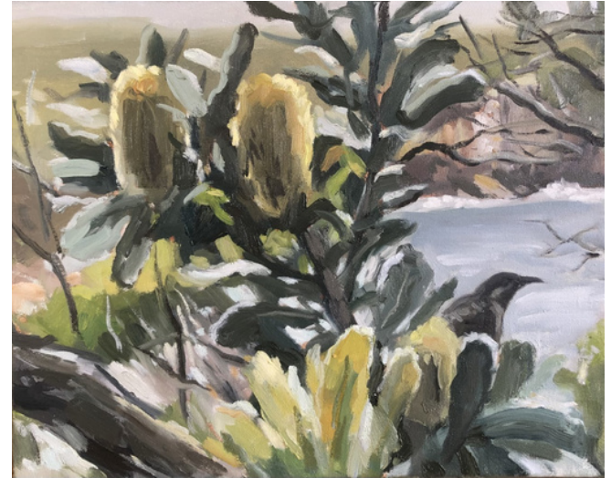
Wattamolla Banksias oil on canvas, 41 x 51cm, framed, $900