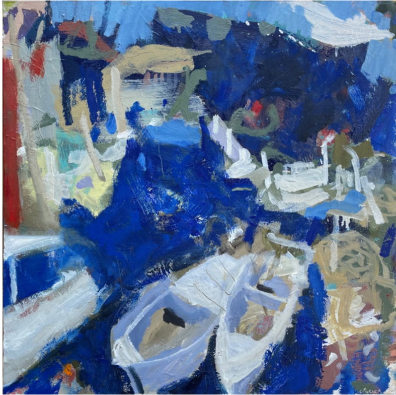
Wynnum Creek 63.5 x 63.5 cm oil on canvas, framed $1,200