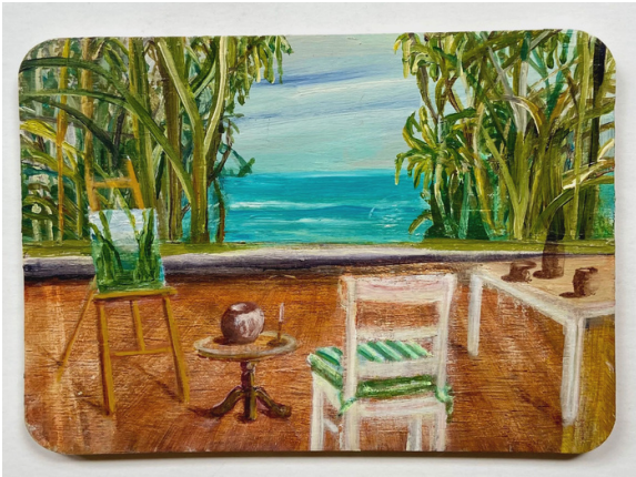
Studio views over ocean Acrylic and ink on board 12 x 17 cm, $450