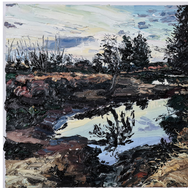
Last light down by the river oil on board, 30.5 x 30 cm, $480