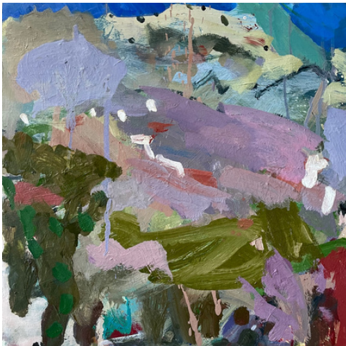
Boonah II 42cm x 42cm, oil on board, framed $840.00