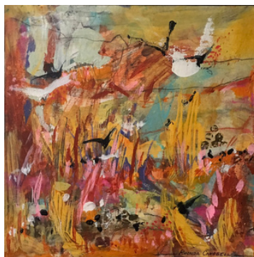
Birds in dry grasses