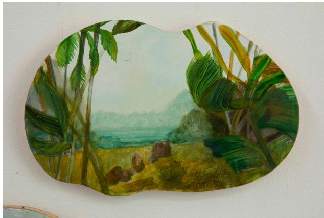
A place to rest Acrylic and ink on board 14 x 21.5 cm $690