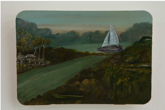
Entry Point to the Hawkesbury Acrylic and ink on board, 12 x 17 cm $550