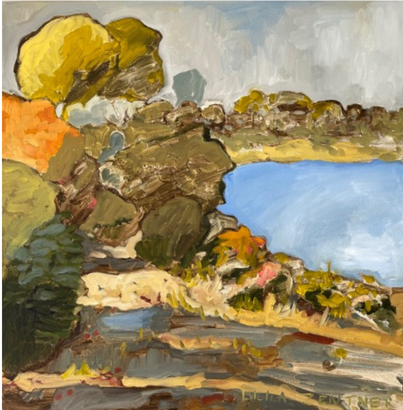
By the Lake 50 x 50 cm oil on canvas, framed $2200