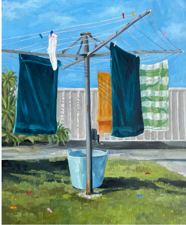
Blue Sky Bucket 30 x 25 cm, Oil On Board, framed $720