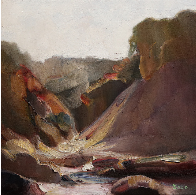
Early in the Day Aireys Inlet Oil on canvas, 40 x 40cm $2200