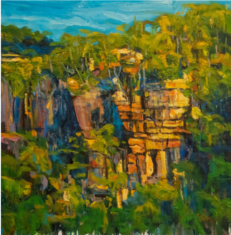
Blue Mountains 1 oil on canvas, framed 61.5 x 61.5 cm $1350