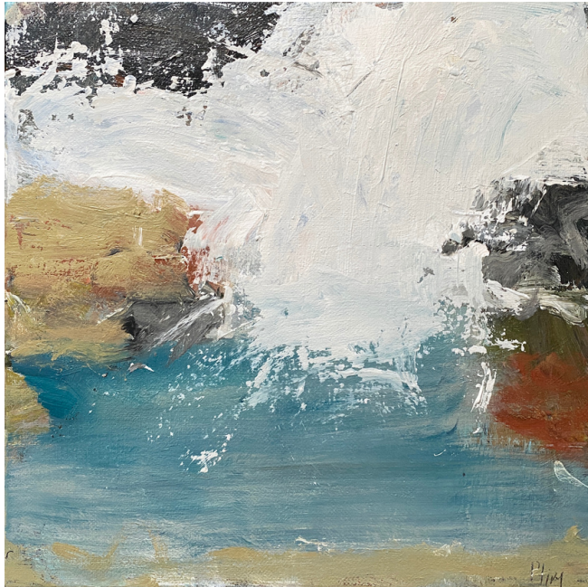
We're Gonna Get our Feet Wet 42 x 42 cm, acrylic on board, framed $680